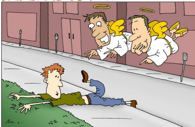
BEING RATHER CLUMSY, HAROLD OFTEN ENTERTAINS ANGELS UNAWARE